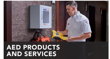
AED PRODUCTS AND SERVICES

Keeping your employees safe is essential. Rely on our van-delivered service and have peace of mind that the safety supplies and personal protective equipment you select will be in stock.