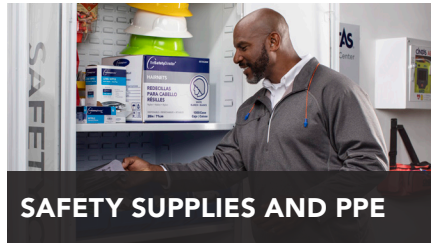
SAFETY SUPPLIES AND PPE

No need to shop for first aid supplies. Our regularly scheduled service keeps you consistently stocked with supplies you select, and helps you be more prepared for workplace illnesses or injuries.