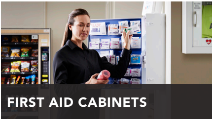
FIRST AID CABINETS

Make sure you're stocked up on supplies and prepared to respond quickly. Our regular on-site service has you covered — including replenishment of the first aid supplies you select, restocking of the safety products and PPE of your choice, AED servicing and safety training.